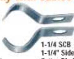
1-1/4 SCB 1-1/4" Side Cutter Blade (2 piece set)