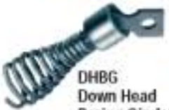
DHBG Down Head Boring Gimlet