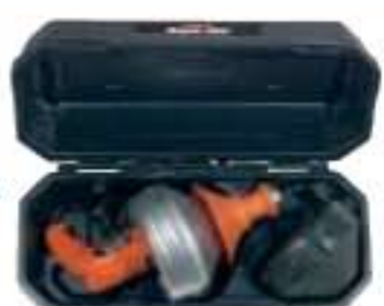
MCC Carrying Case